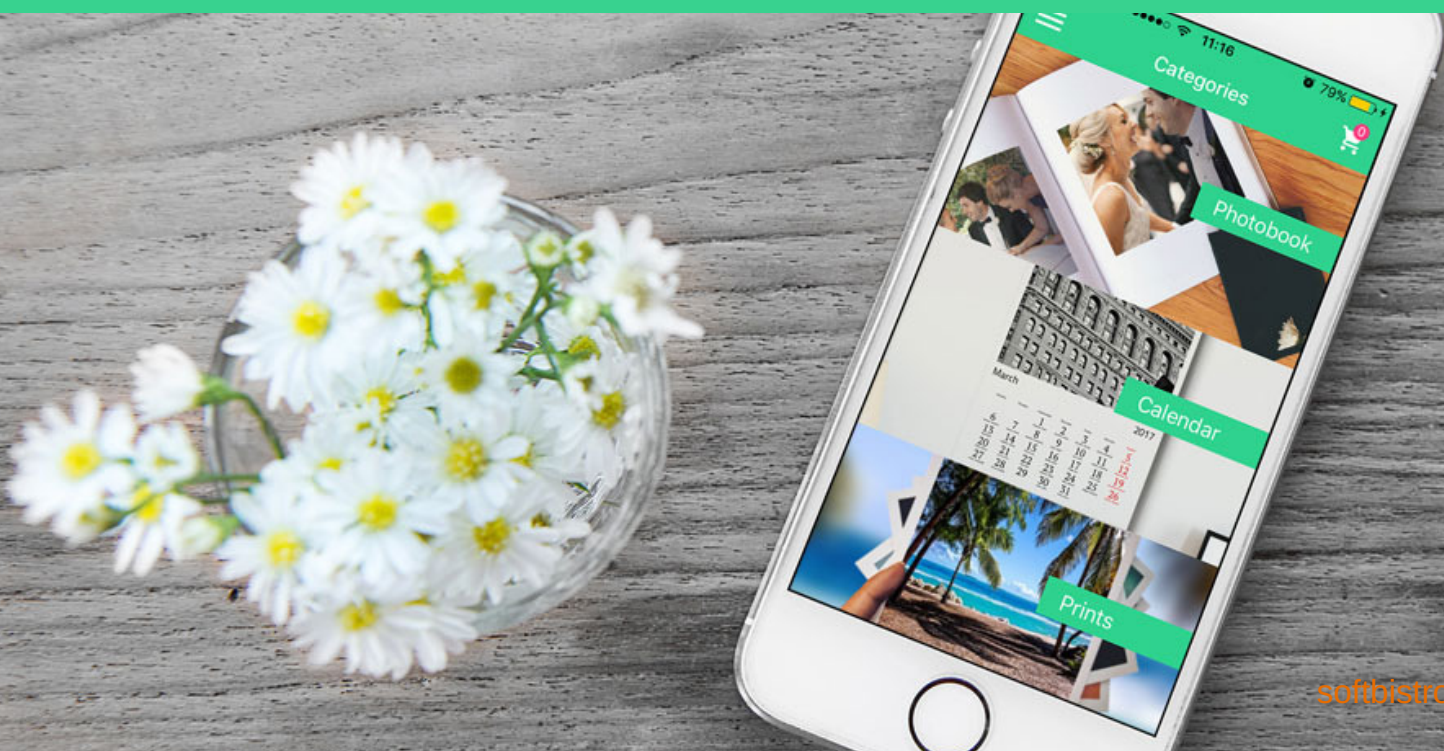
Figure out and implement the best practice to store photos without using client's hardware.